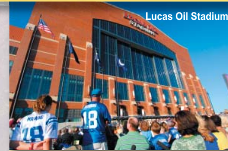
Lucas Oil Stadium

Lucas Oil Stadium is a multi-use, all-weather venue that features a retractable roof. The home of the NFL's Indianapolis Colts seats 63,000 for football games and will be connected to the Indiana Convention Center via a climate-controlled walkway.