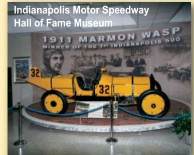
Indianapolis Motor Speedway Hall of Fame Museum

The IMS Hall of Fame Museum has one of the world's largest, most varied collections of racing, classic and antique cars including the Marmon Wasp, the first car to win the Indianapolis 500.