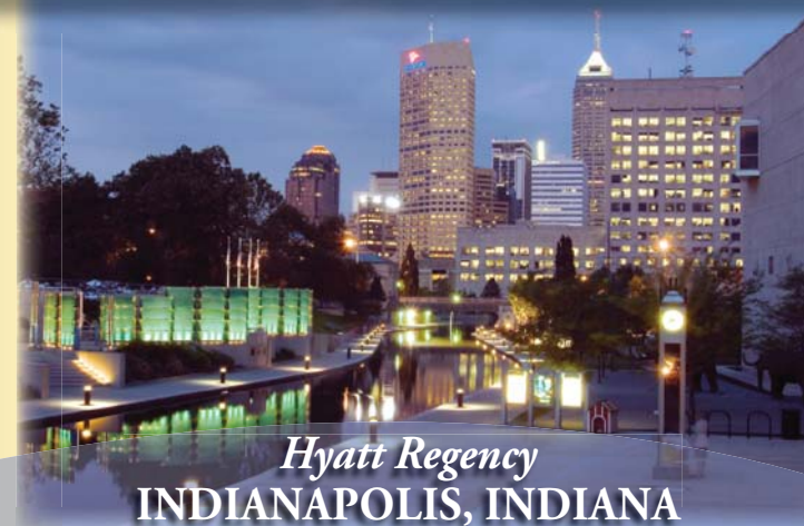
Hyatt Regency INDIANAPOLIS, INDIANA October 8-10, 2010