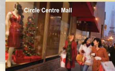
Circle Centre Mall

Circle Centre Mall is in the heart of downtown, just steps away from Monument Circle. Anchored by Nordstrom and Carson Pirie Scott, Circle Centre features 100 specialty stores, fine dining, food court and convenient parking.